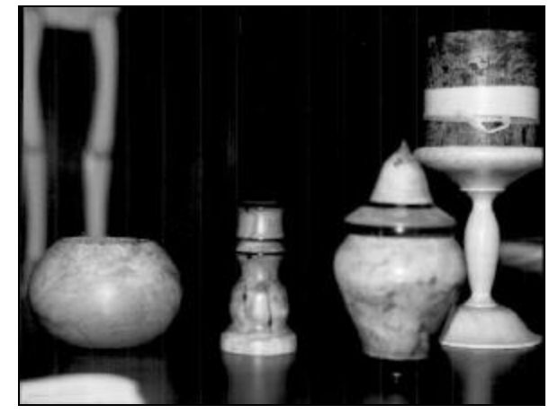
Show and Tell Beauties