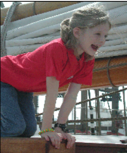
Here's one happy sailor!