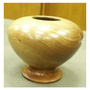
Bob Colebeid showed two bowls of silky oak with laquer finish. They were both nicely turned with a pleasing shape.