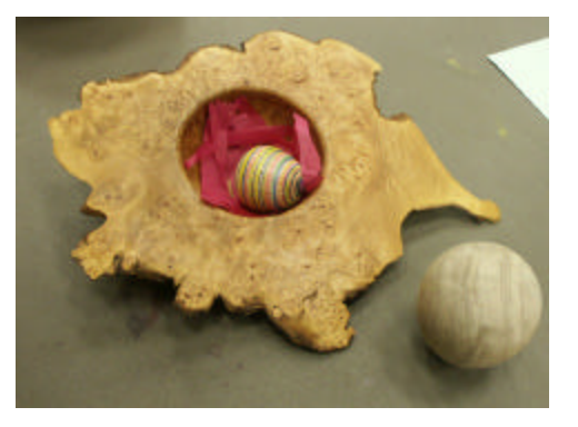
Intermediate: Earleen Ahrens