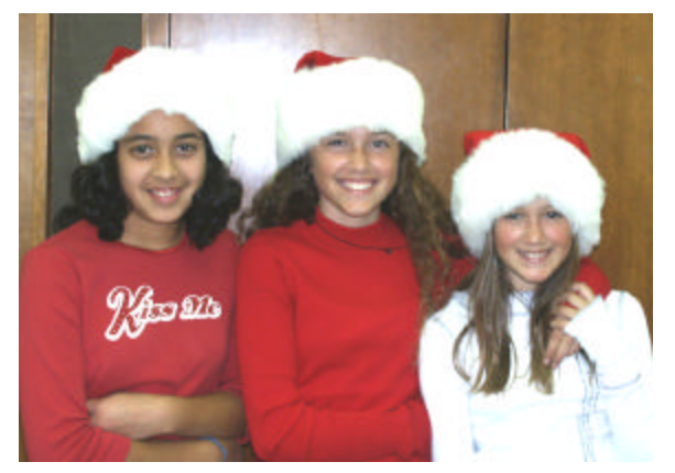
The 3 little elves