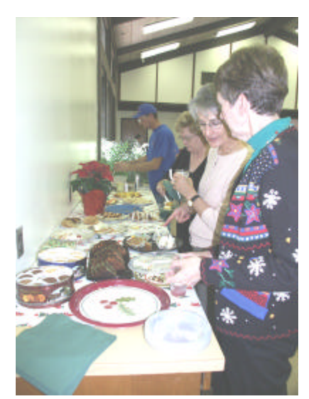
The dessert line