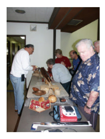
Items up for auction