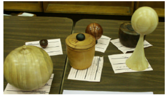
Advanced Challenge containers