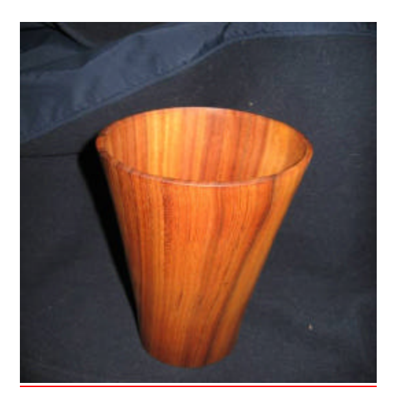
Jim Givens made a hollow vessel using Tulip wood.