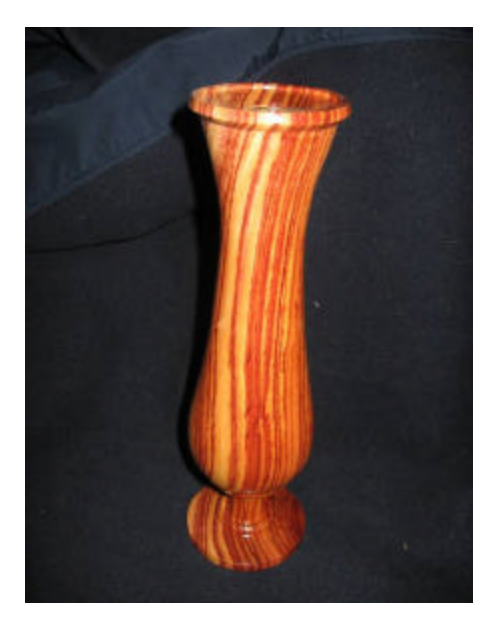
Floyd Petersen brought in a segmented bowl and a segmented hollow vessel. Both with a waterlox finish. Beautiful work.