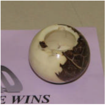
Al Sobel made three open vessels. One had some cracks filled in blue. Another has a walnut base for a bit of lift.