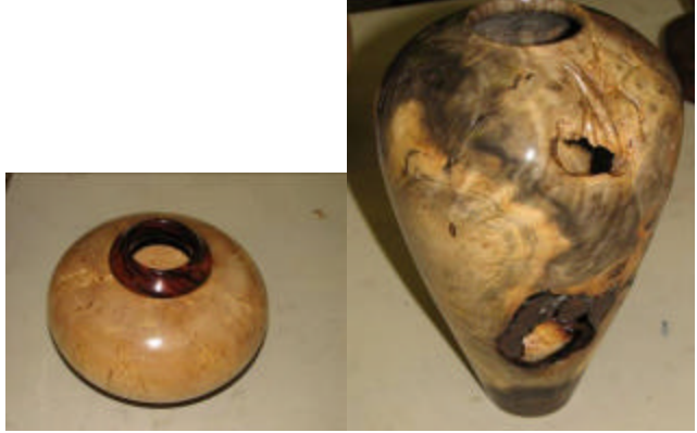
The second vessel was turned from Buckeye and finished in lacquer.

Jack Wooddell turned two small vessels from some "mystery" nuts.