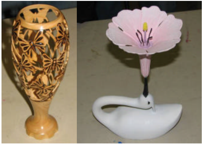
The forth was an Elm and Walnut goblet with carved butterflies and oak leaves entitled "Swarm". The fifth was a bowl of Goncalvo Alves with feet entitled "Four Poster".

"Migration." The third was a bass wood and cedar piece called "Balancing Beauty" of a bird and flower.