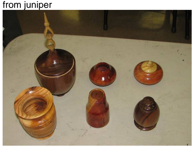
Jim O'Connor brought in two off center walnut vessels finished with carnauba wax.

Al Falck brought in six entries. They were turned from walnut, carob, Carolina oak, oak and two