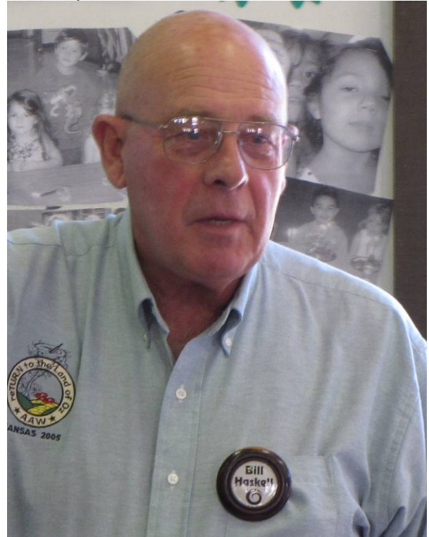
Some shots from the top contest.