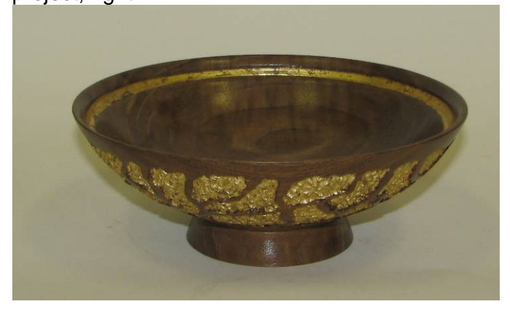
.And last but certainly not least was Pete Carta who brought in. a wing bowl or banana bowl that