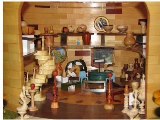
Here are two pieces from the instant gallery.

Here is a look inside of the winning chapter collaborative piece from the Dallas Area Woodturners entitled "Woodturners Museum of Art." They won the artistic category and won Best of Show.