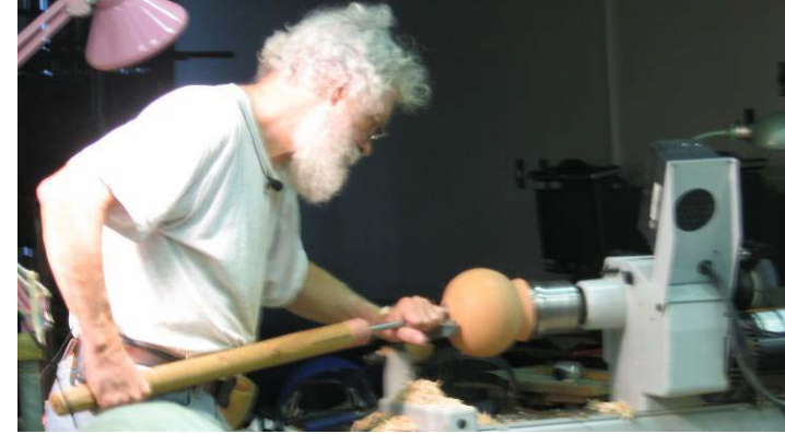
general inspiration is early American Indian pottery forms; that is not surprising as he has a

you turn it around into the jam chuck. Also try to keep your head or eye above the tip of the tool. He uses a ½ inch thick foam backer pad behind Abranet for sanding his pieces. His