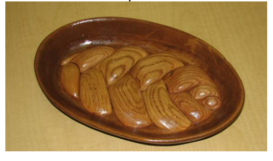
Floyd Pedersen brought in three different bowls and a cowboy hat. The first two were segmented bowls of Walnut and Maple and various woods.