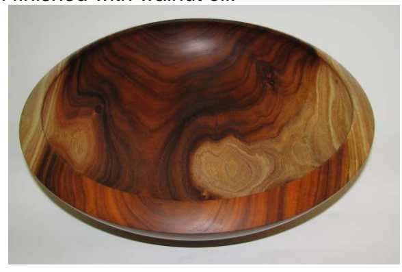
Sandy Huse brought in what she called a "drunkards bowl" because it had a rounded bottom; it was turned from Walnut and finished with walnut oil.