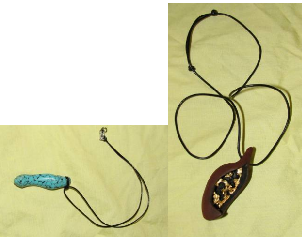
Then a purple and brown acrylic and the fourth was a Rosewood piece.