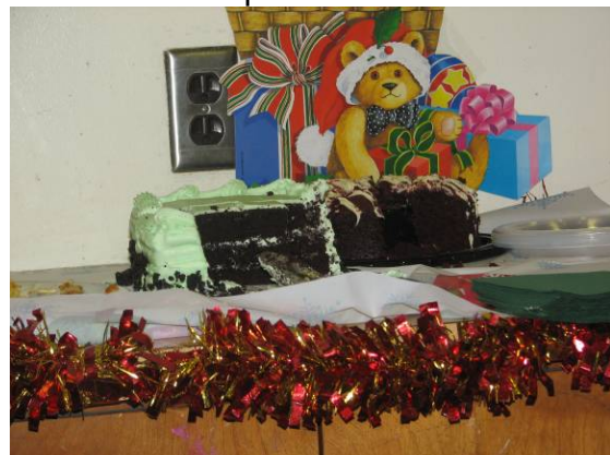
Lots of good desserts filled us all up!