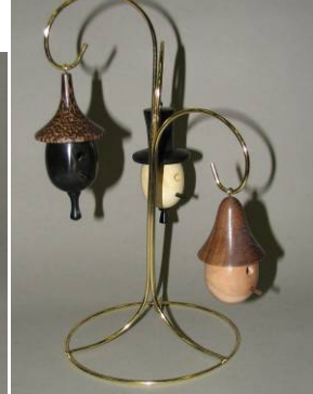
He also brought in two bowls of turned eggs of various woods.