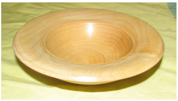
Then we had Nick Tuzzolino bring in a natural edge bowl turned out of mystery wood with an oil finish.