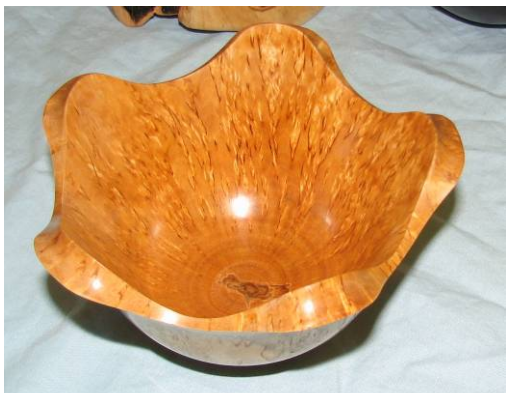
He also had a second taller bowl also of Masur Birch. And a third bowl that was nine sided and turned and carved from Alabaster.