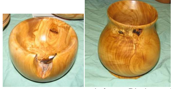
The next one was tuned from Birch and the category winner was a bowl turned from Ficus with a Good Stuff finish.