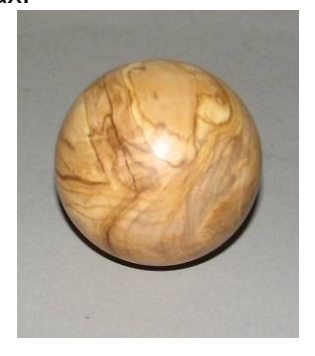
Steve Cassidy brought in a Maple sphere finished with friction polish.