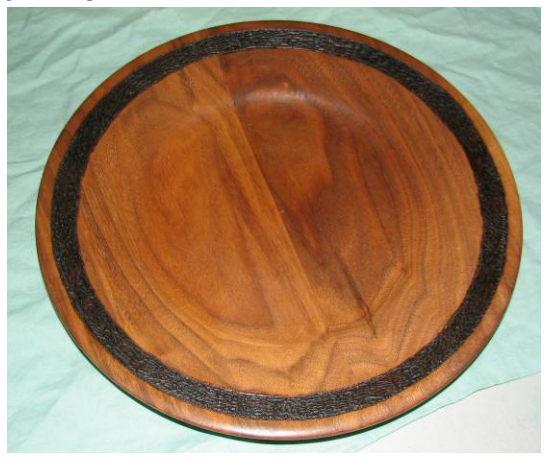
Pete Carta brought in a small plate turned from Walnut with a wax finish.