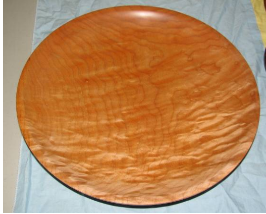
He also brought in a plate turned from crotch Walnut and another turned from Myrtle. All had the Maloof finish.