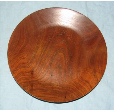
Amy Earhart brought in a plate turned from Quarter Sawn White Oak with a Mahoney oil and Mahoney wax finish.