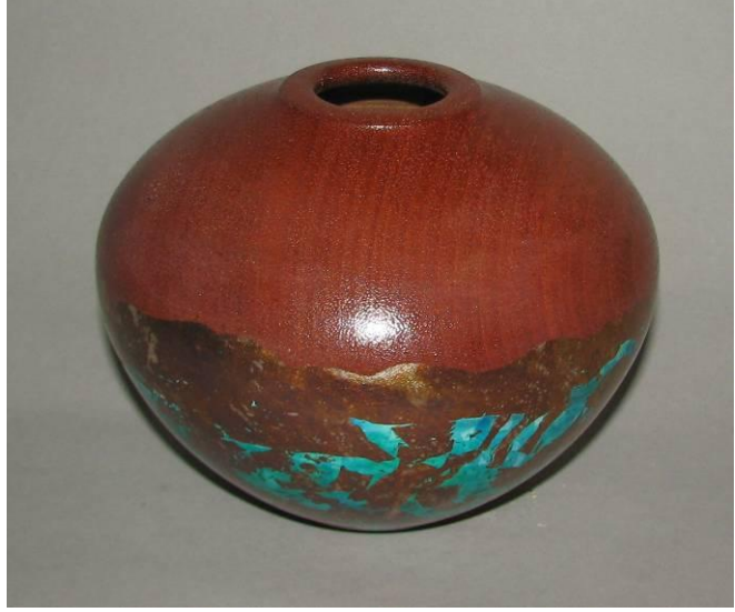
We all have a new technique to now have fun with!