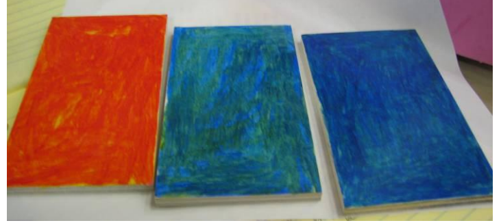
Here are some sample boards that Bill brought. And here is a close up of the hollow vessel that has been colored and then had leaf applied.

it has dried. Now you are ready for color, At this point you will only be mixing small amounts of paint so purchase some 1 ounce medicine cups from a place like Smart and Final; these are perfect for this part of the operation. Buy a good quality acrylic paint from an art store, the better the quality the better the pigments and therefore the colors will be brighter. Start with the lighter colors and then go darker. Mix the paint with a bit of water to get a thinned mixture that you will apply with a Q-tip. Now roll it on the board and add colors until you get a look that you like. Remember to write down the colors used so that you can repeat the process. When the samples are done you should spray them with a coat of shellac or lacquer and that will also help to bring out all of your colors that you applied.