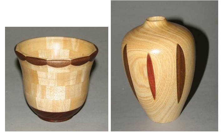
The third was a nice hollow vessel turned from Camphor. All were finished with oil.